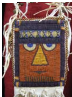
Beaded Purse from Purple Lizard Boutique

During breakfast at the Top of the Rock Restaurant, enjoy informal modeling presented by the Purple Lizard Boutique, described by Phoenix Magazine as the "Best boutique for desert-dwelling, natural-fiber-favoring, sensible shoe-wearing, Frida Kahlo-adoring, tortoiseshell-glasses-peering, scented-candle-burning, silver jewelry-accessorizing women."