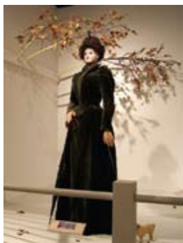
LaBelle Epoque, Vancouver Museum.

Museums tell stories about dress artifacts that are enmeshed in holistic, bodily practices. Ordon's presentation explores how museum exhibits can draw attention to the role of bodies and senses both by crafting meaningful embodied and multi-sensorial experiences and also by explicitly encouraging visitors to reflect on embodiment. Based on a comparative, qualitative case study of three fashion exhibits, she identifies several variables that encourage people to consider the importance of the body and senses in dress practices and to consciously cultivate meaningful, substantive, and pleasurable experiences with dress.