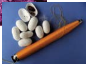
Top: Inexpensive American silk imitation circa 1900 Jacquard; Above: Cocoon to thread for industrial looms.