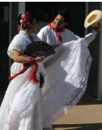
Ballet Folklorico Alegria